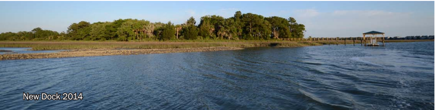
New Dock 2014