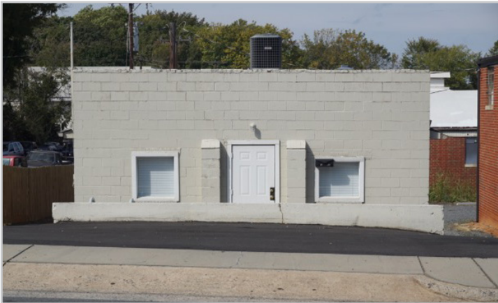
3122 S. Tryon Street | Parcel ID: 14505409 .172 Acres | 875 S