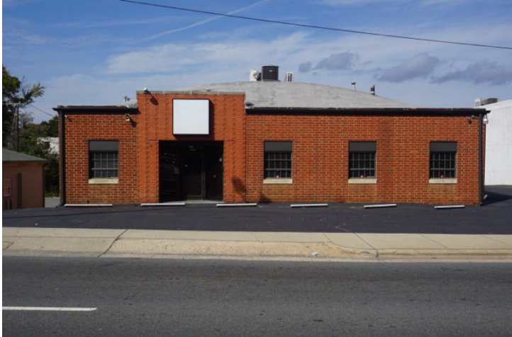
3116 S. Tryon Street | Parcel ID: 14505410 .344 Acres | 4,320 SF