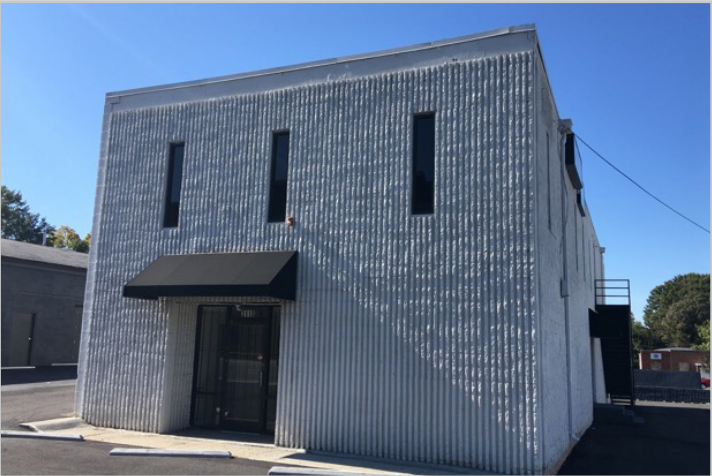
3110 S. Tryon Street | Parcel ID:14505411 .258 Acres | 5,400 SF