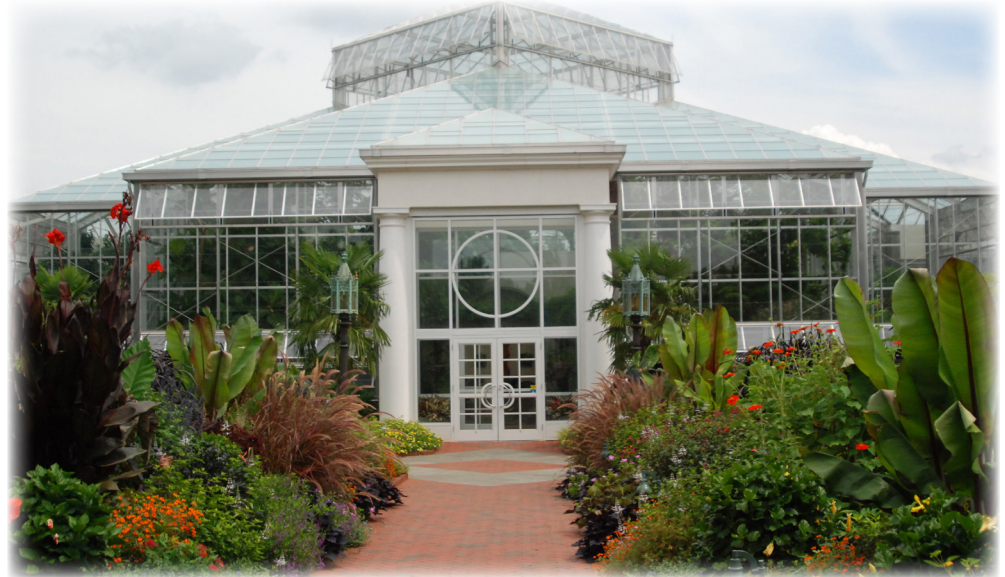
Stowe Botanical Gardens

Rich in history, Gaston County originally found success in textile production and still remains the top county in cotton consumption and in the number of operating spindles. Today, the county is home to a number of businesses in a variety of manufacturing industries.