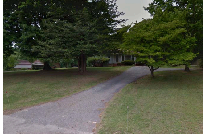
1769 N. NC HWY 16