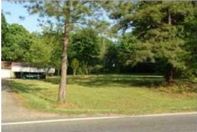
1753 N. NC HWY 16

Three land parcels zoned Neighborhood Business for sale on busy Hwy 16 in Denver, NC. Parcels can be divided or sold as a group.