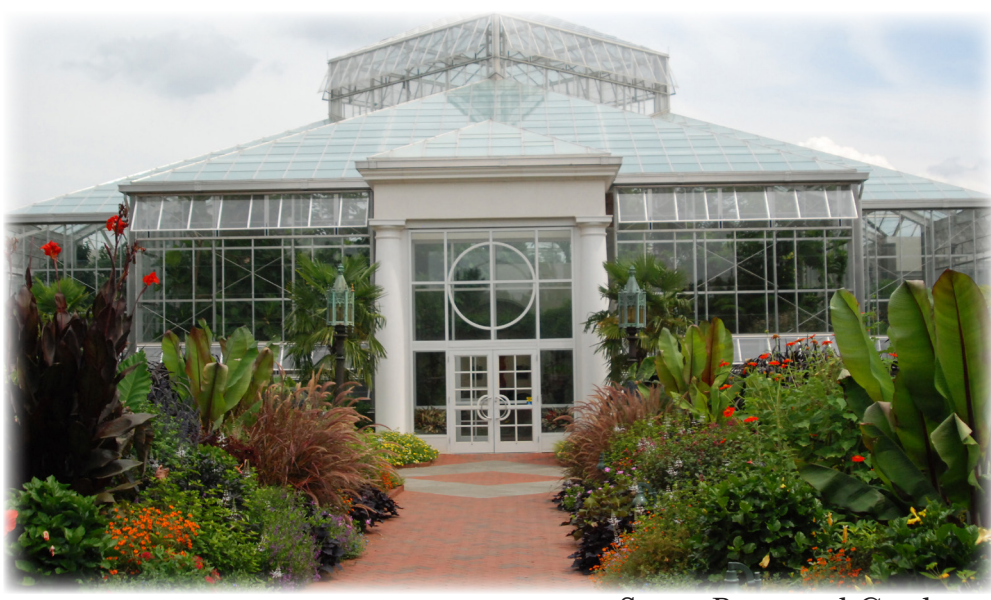
Stowe Botanical Gardens

Rich in history, Gaston County orginally found success in textile production and still remains the top county in cotton consumption and in the number of operating spindles. Today, the county is home to a number of buisnesses in a variety of manufacturing industries.