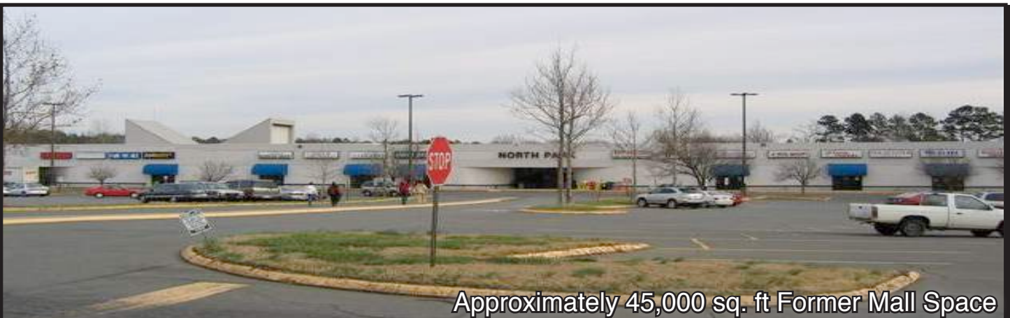
Approximately 45,000 sq. ft Former Mall Space