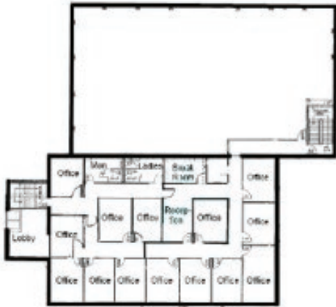
Suite 200 / 5000sf