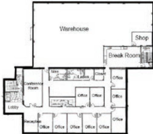
Suite 100 / 5508 sf