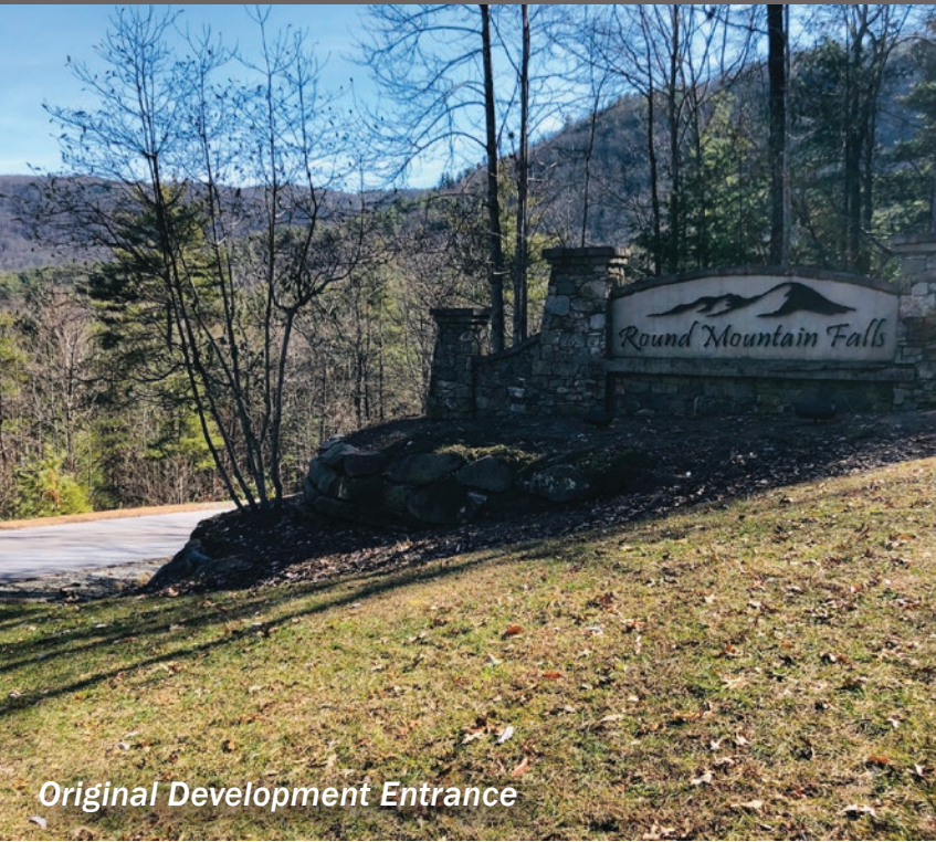
Original Development Entrance