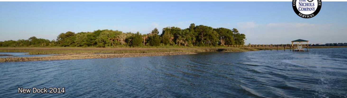
New Dock 2014