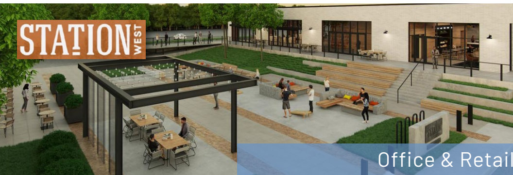
Office & Retail +/- 67,000 SF