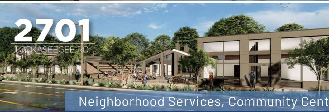
Neighborhood Services, Community Center, Retail, Restaurant, Office +/- 1.053 AC