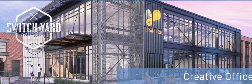
Creative Office +/- 92,000 SF