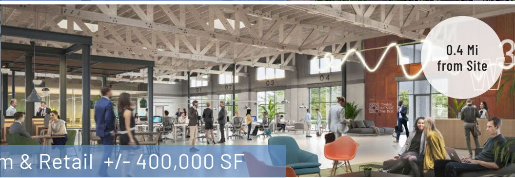
0.4 Mi from Site