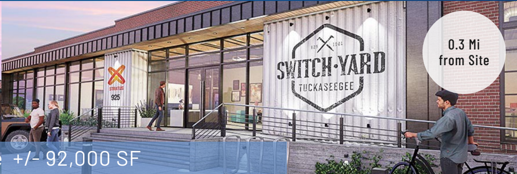
0.3 Mi from Site