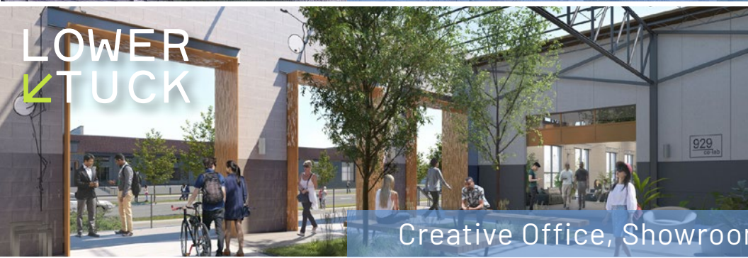
Creative Office, Showroom & Retail +/- 400,000 SF