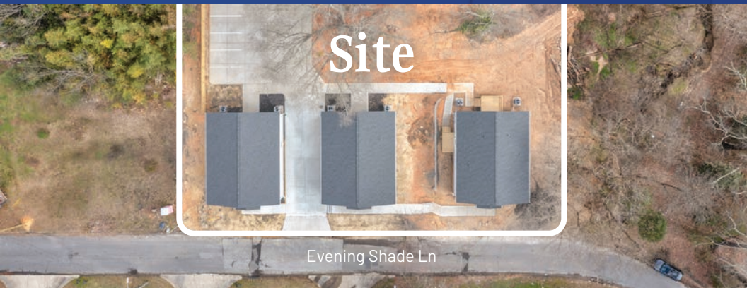
Evening Shade Ln