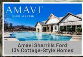
Amavi Sherrills Ford 134 Cottage-Style Homes