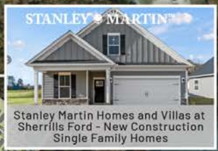
Stanley Martin Homes and Villas at Sherrills Ford - New Construction Single Family Homes

Future Development Commercial Space & Multi-Family