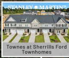
Townes at Sherrills Ford Townhomes