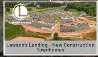
Lawson's Landing - New Construction Townhomes