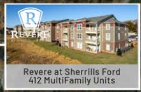
Revere at Sherrills Ford 412 MultiFamily Units