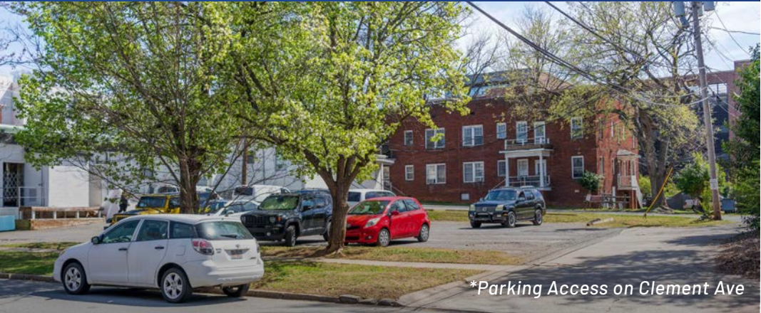
*Parking Access on Clement Ave